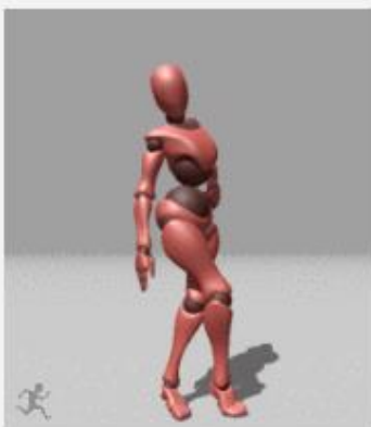
Female Standing Pose