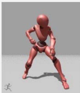
Female Action Pose