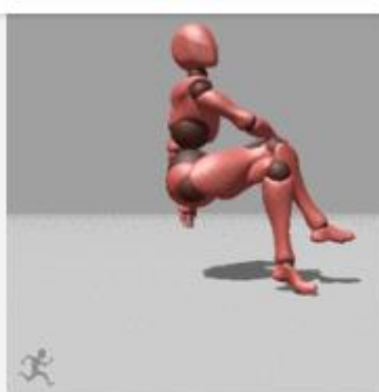
Female Sitting Pose