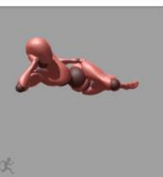
Female Laying Pose