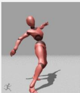
Female Action Pose