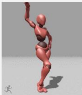
Female Standing Pose