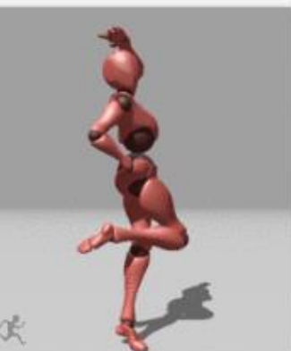
Female Standing Pose