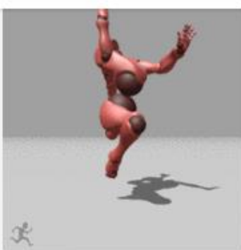
Female Dynamic Pose