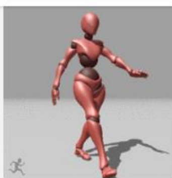
Female Tough Walk