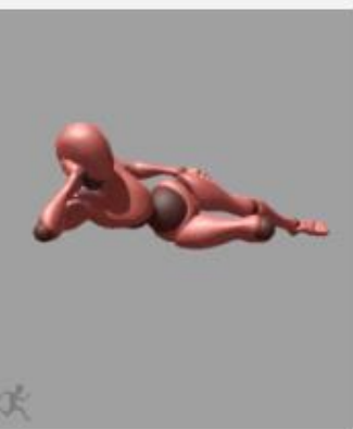
Female Laying Pose