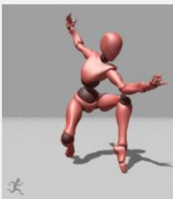
Female Dance Pose